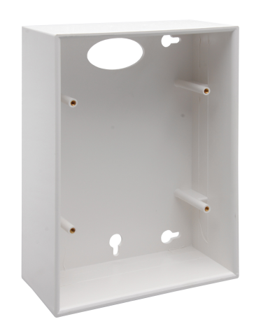
CMRBB on-Wall box for CMR loudspeaker range