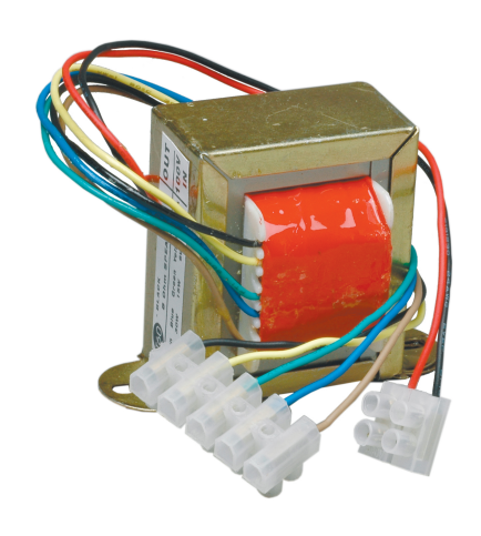
T60 8 ohms / 100 volt transformer, 60 watts