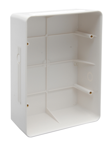
CMRBBI In-wall box for CMR loudspeaker range