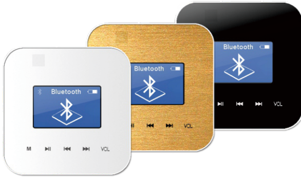
Home intelligent music control system