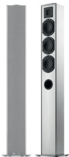
TMicro 60 AMT