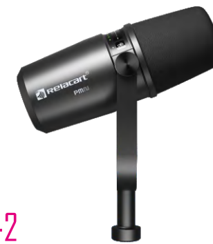
PM-2 Cardioid Dynamic Podcasting Microphone