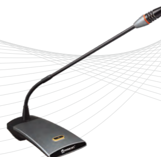
CS-101D Delegate Unit