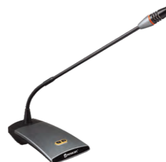
CS-101C Chairman unit