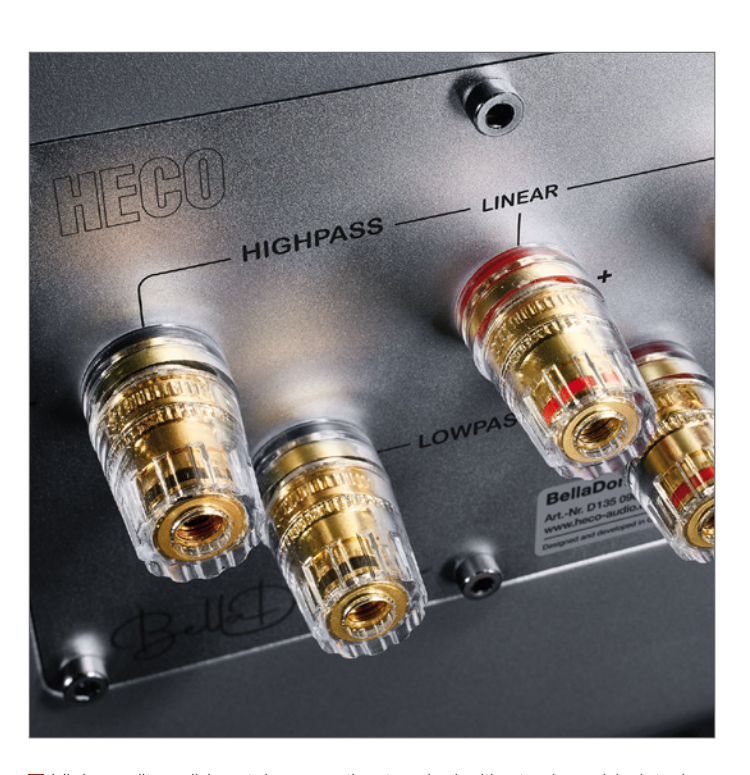
■ High-quality solid metal connecting terminal with sturdy, gold-plated high-end screw terminals