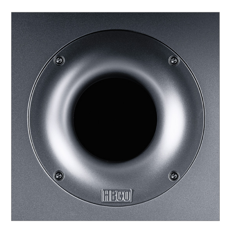
■ Bass reflex configuration with flow-optimized and screwed reflex port