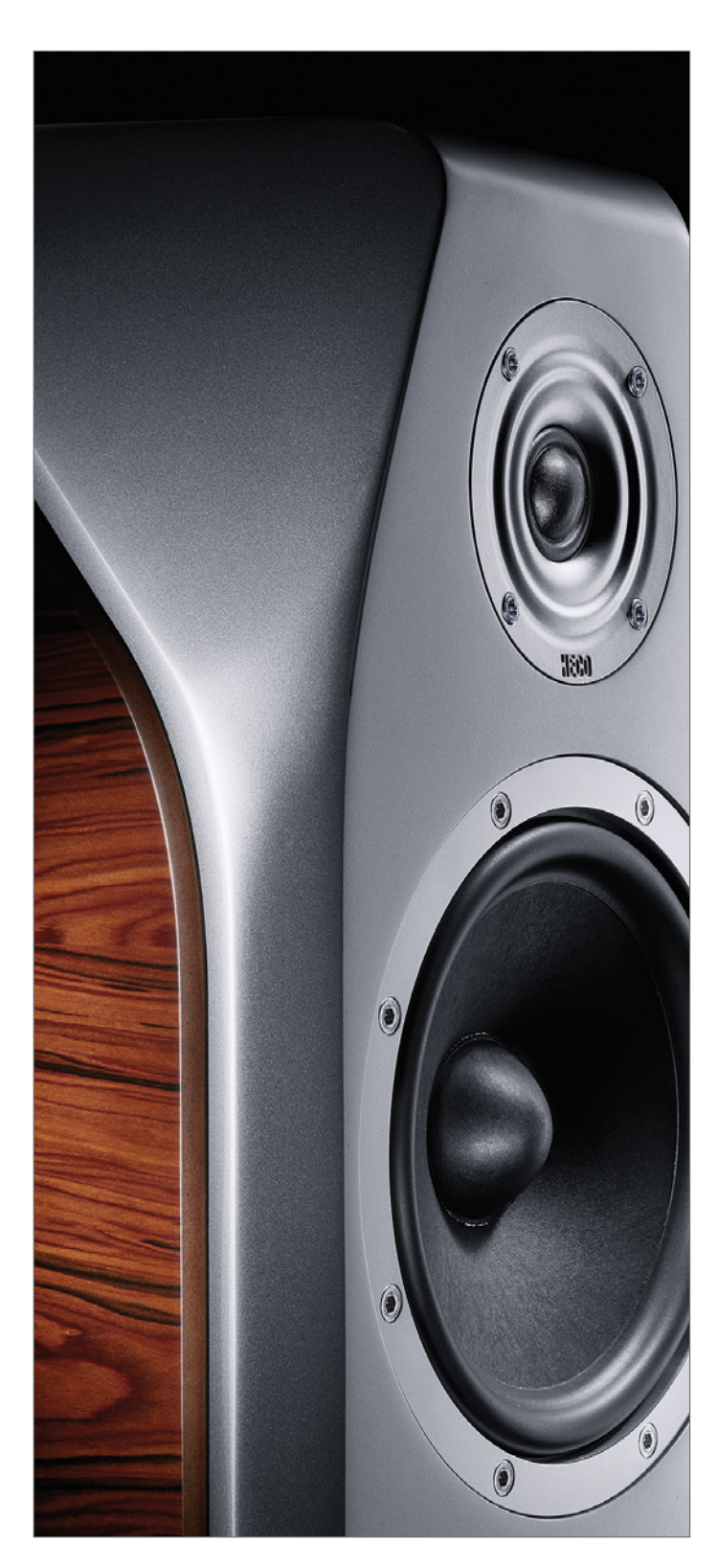
■ Newly developed bass-midrange driver with HECO kraft paper cone, POC dust cap (Phase Optimization Cap) and low-loss rubber surround in a sturdy die-cast aluminum basket.