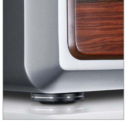
A secure stand as a compact loudspeaker even without a stand thanks to the unit feet included in the scope of delivery