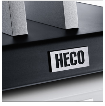
■ Heavy and low-resonance construction with four sturdy aluminum struts and 36 mm thick MDF base plate