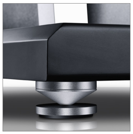
■ Height-adjustable solid metal spikes with floor-friendly, damped solid metal pads