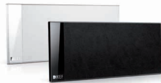
T101 and T101c speakers.

Mounted vertically as satellites (whether wall-mounted, on the desk stands supplied or the optional floor stands) or horizontally as a centre channel above or below the TV, the standard T Series speaker features KEF's new 115mm (4.5in.) ultra-low profile bass and midrange driver paired with the high performance new 25mm (1in.) vented tweeter.