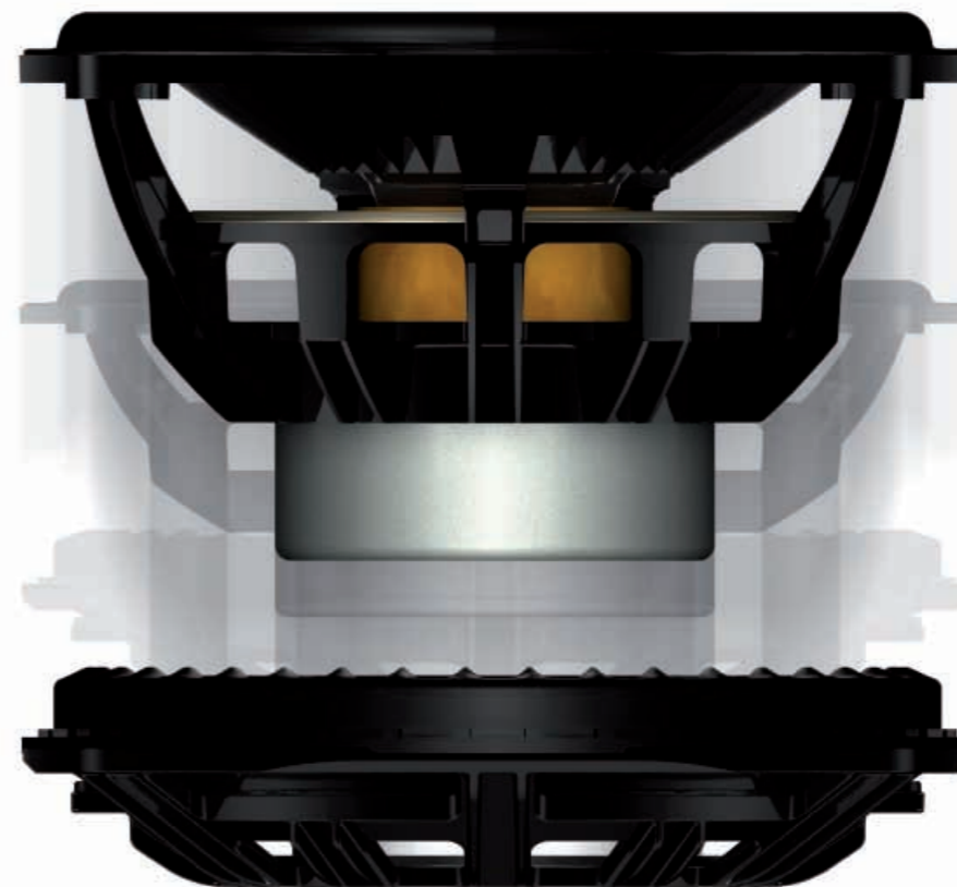
KEF's patented ultra-slim bass driver